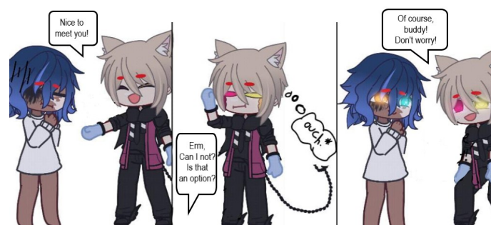
Image Credit: Ellen Dixon: Ellen shares in this image their interpretation of the difficulties they may experience in being asked to make eye-contact or give a handshake when they do not want to.