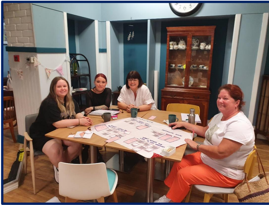
Figure 2 Some of the Representatives on the Rumworth Task Group