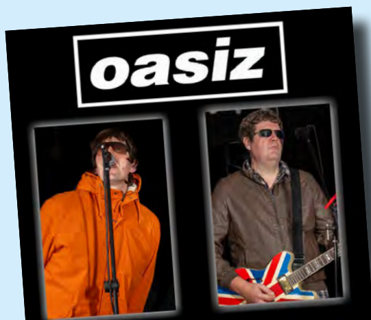
Oasis Tribute Band 29 March