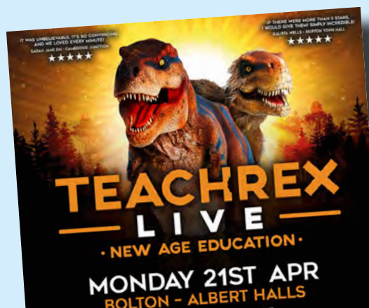
Teach Rex LIVE 21 April

Tel 0343 208 0500 www.alberthalls-bolton.co.uk