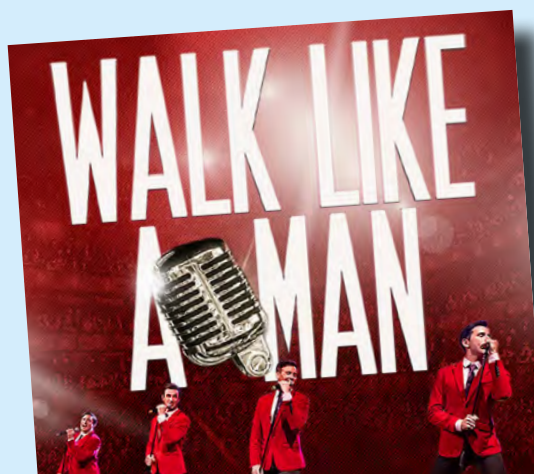
Walk Like A Man 4 April