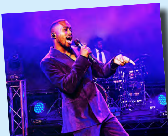
Marvin Gaye Songbook 20 March