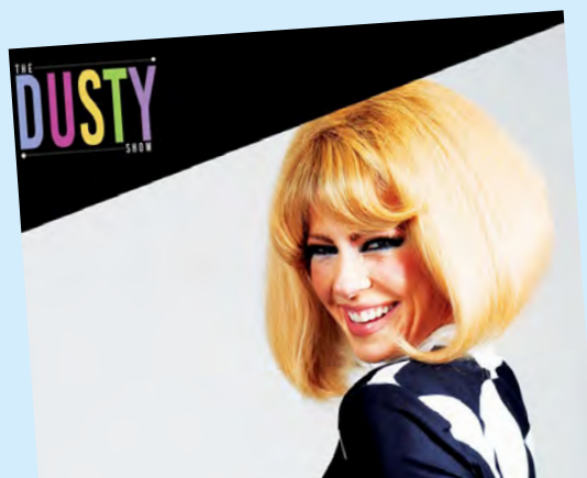
The Dusty Show 21 March