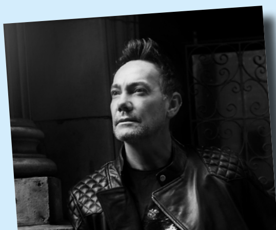
Craig Revel Horwood Revelations 12 April