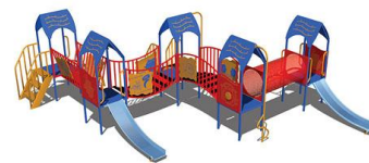
King Cole Multi-play