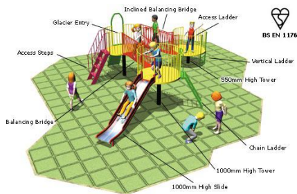
Labyrinth Play Unit