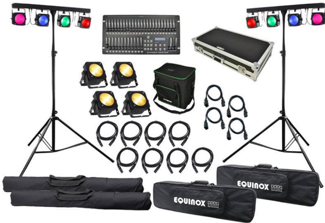
Portable LED Stage Lighting Set