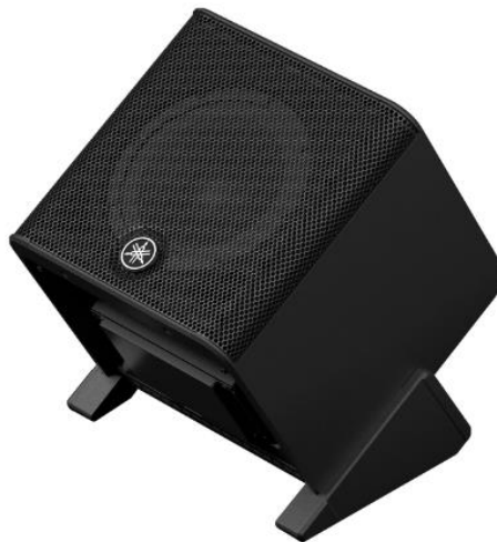
Yamaha Stagepas 200 Portable PA System (all-in-one wireless system) Quantity: 1

Can be controlled remotely via an iOS or Android device using the dedicated Stagepas Controller app.