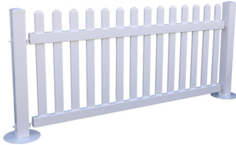
Picket fencing (1.8m / 6ft) Quantity: 30 fence sections