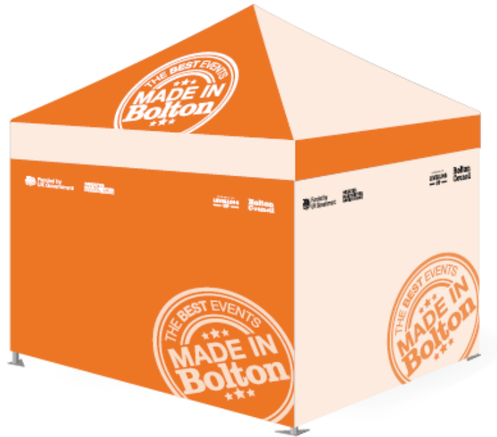
Gazebo (3m x 3m)