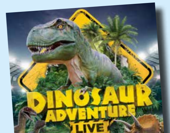
Dinosaur Adventure Live 12th February 2023