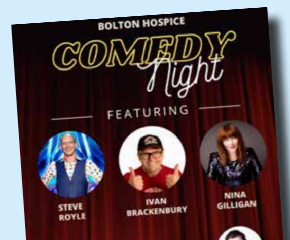
Bolton Hospice Comedy Night 4th February 2023