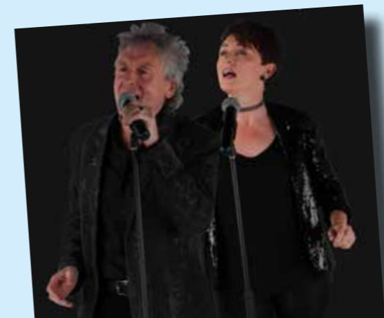
Christmas Party Night featuring Vogue 9th and 16th December 2022