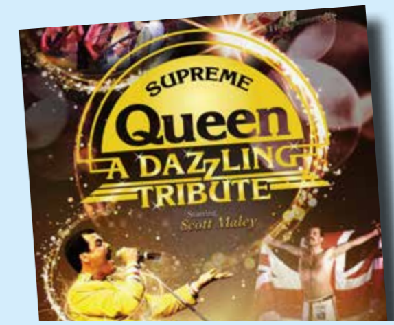
Supreme Queen 17th March 2023