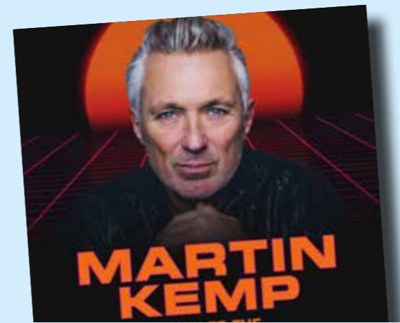
Martin Kemp - Back to the 80s DJ set 4th March 2023