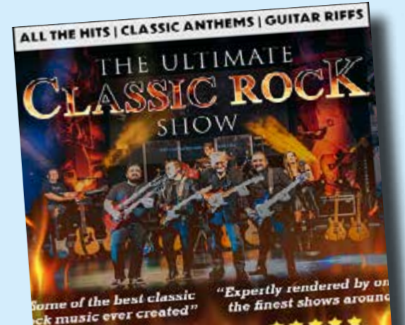
The Ultimate Classic Rock Show 14th January 2023