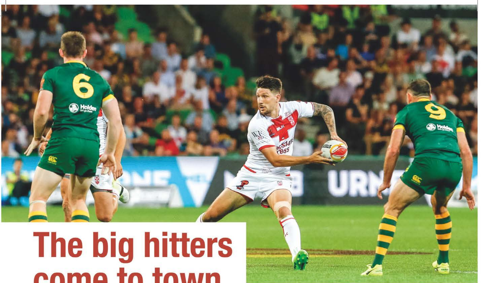
↑ England's Gareth Widdop goes for World Cup glory during the 2017 tournament against Australia