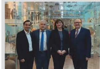
Secretary of State for Digital, Culture, Media and Sport Baroness Nicky Morgan praised the new look Bolton Museum galleries during her visit to the borough

Over the next few months, there are exciting times ahead for Bolton and our towns within the borough, as this administration begins to deliver the ambitious regeneration programme that our town and borough so desperately needs.