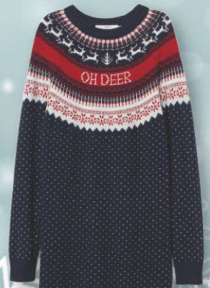
Jacquard-knit Dress £24.99 H&M