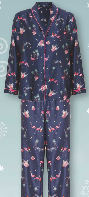
Pyjama Top and Bottom £25.00 each M&S Collection