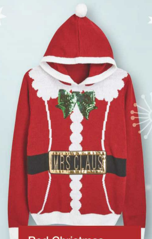
Red Christmas Mrs Claus Sweater £30.00 Next