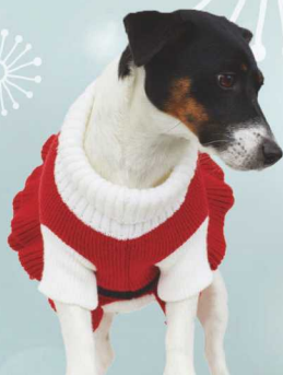
Knitted Dog Dress £9.99 H&M