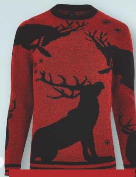
Red Reindeer Boucle Christmas Jumper £30.00 River Island