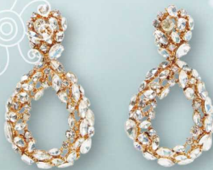
Gem Earrings £19.99 Zara