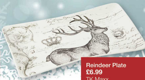
Reindeer Plate £6.99 TK Maxx