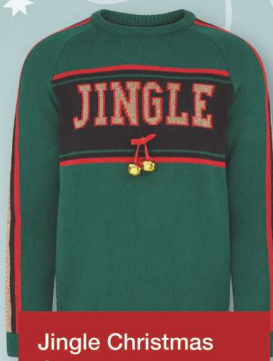
Jingle Christmas Jumper £30.00 River Island