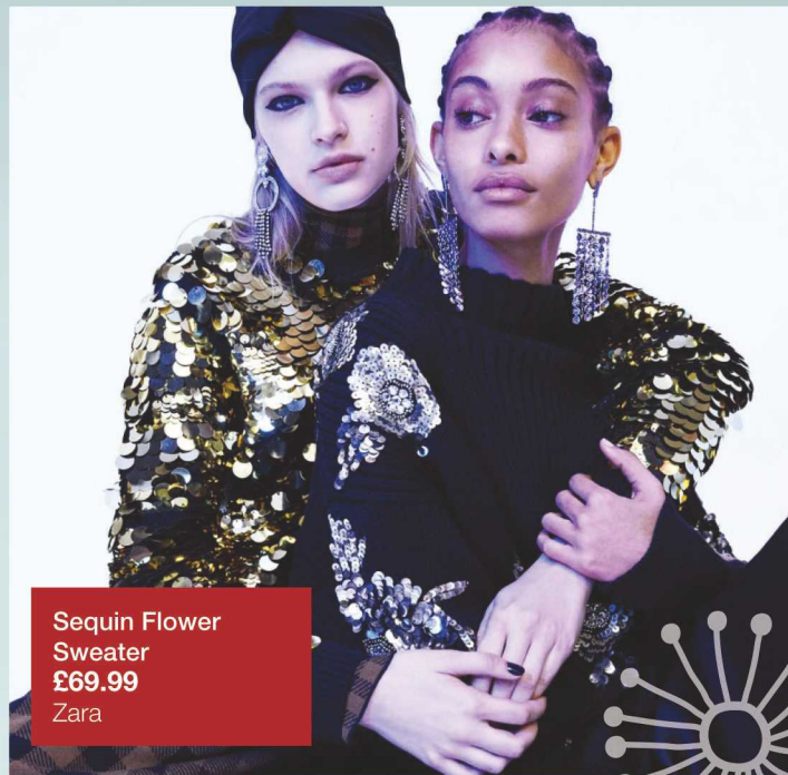
Sequin Flower Sweater £69.99 Zara

With only a few weeks to go until Christmas there's still time to get yourself ready. Whether you're going out, enjoying the office party, decorating the home or kitchen table or just relaxing there is something for everyone in Bolton town centre.