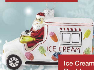
Ice Cream Van Bauble £6.99 TK Maxx