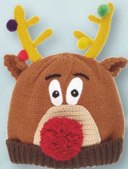
Rudolph Christmas Hat £15.00 Next