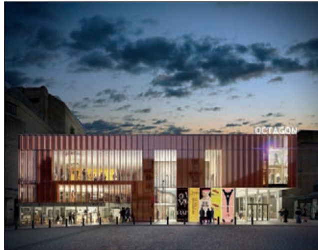
CULTURE ATTRACTION: Plans to redevelop the Bolton Octagon Theatre will see it greatly expand