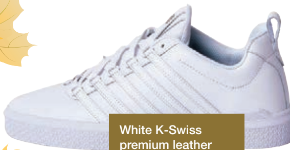
White K-Swiss premium leather trainers £70.00 River Island