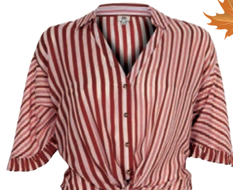
Red Striped Tie Front Cropped Shirt £28.00 River Island