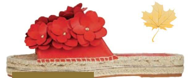
Sandals £30.00 River Island