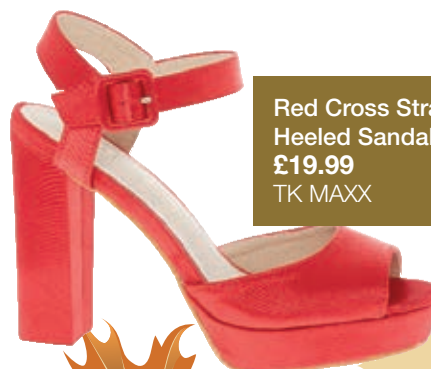
Red Cross Strap Heeled Sandals £19.99 TK MAXX