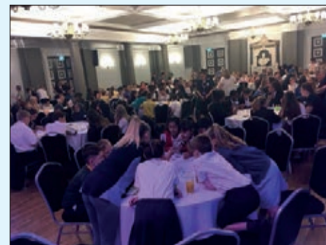
FRESH IDEAS: Young people presenting their thoughts at the Youth Vision conference