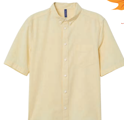
Yellow Short-sleeve Shirt Regular Fit £9.99 H&M