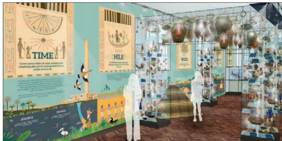
AFTER LIFE: How the full size replica of the pharaoh's tomb will look

The museum has been closed since December