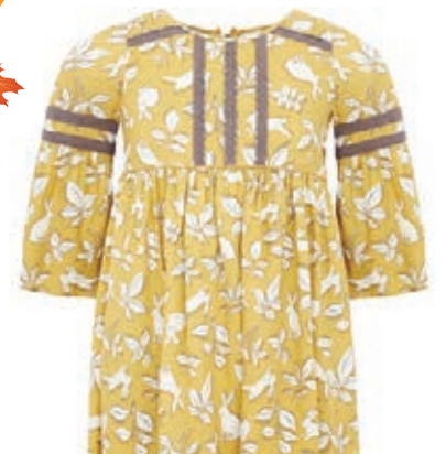
Yellow Dress and Jacket Combo £16.99 TK Maxx