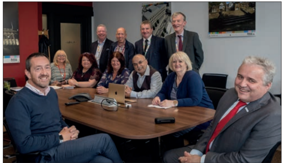
SAFE ROUTES: Champion cyclist Chris Boardman presenting the plans to the council's Cabinet

Greater Manchester's Cycling and Walking Commissioner, Chris Boardman, said: "The list of proposed projects announced is the first of many for each local authority. One thing we won't compromise on is quality; we're working closely with all 10 local authorities."