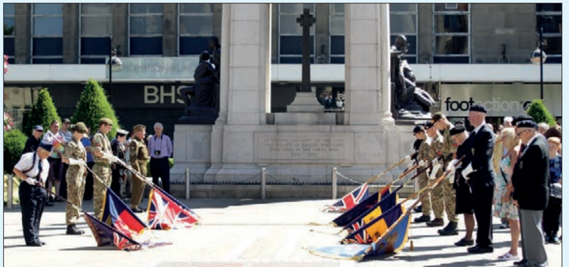
COMMEMORATION HONOUR: Members of local veterans organisations and other groups took part in a service and wreath laying as part of the Armed Forces Day events

It was attended by the Duke of Lancaster Regiment; 216 Battery Bolton Artillery; Bolton United Services Veterans Association (established 1906), other veteran organisations and Bolton's Combined Forces Cadets.