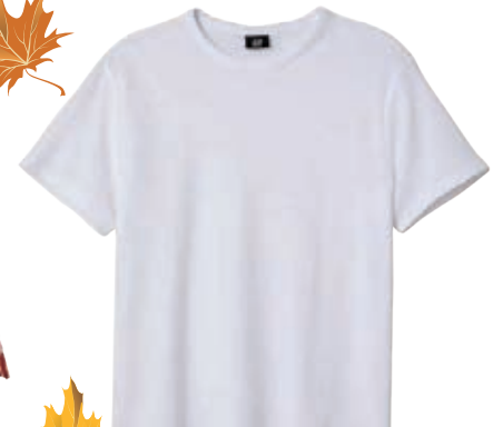
White Round Neck T-shirt £3.99 H&M