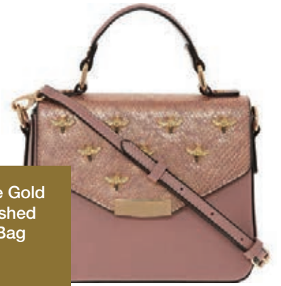
Blush & Rose Gold Tone Embellished Cross Body Bag £34.99 TK MAXX

We have perfect outfits that could be chosen from that are stylish and comfortable for men, women and children. They are suitable to be worn all day and night.