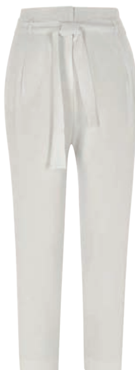
White Tapered Leg Trousers £36.00 River Island