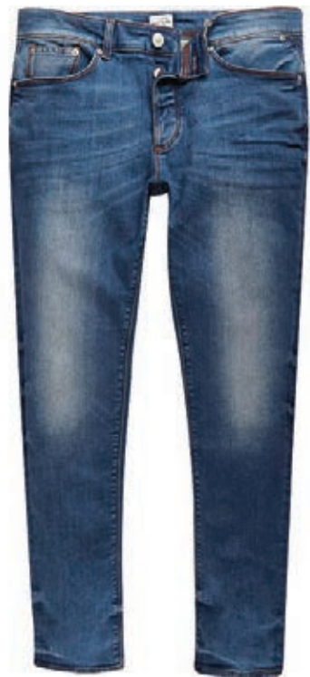
Big and Tall Blue Sid Skinny Jeans £35.00 River Island