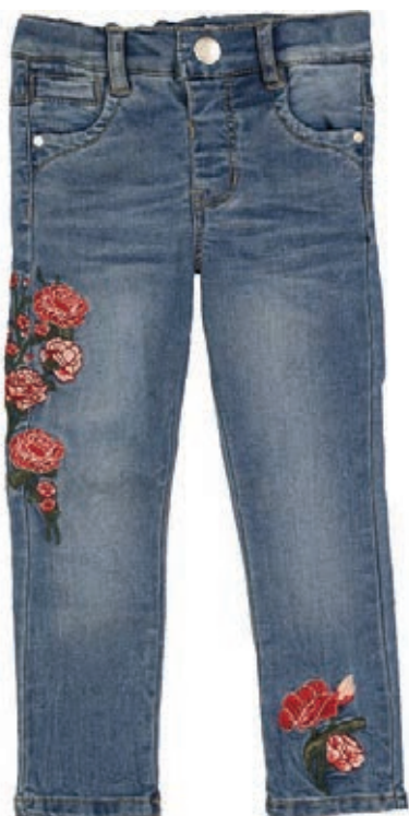
Blue Washed Floral Embroidered Jeans £9.99 TK Maxx