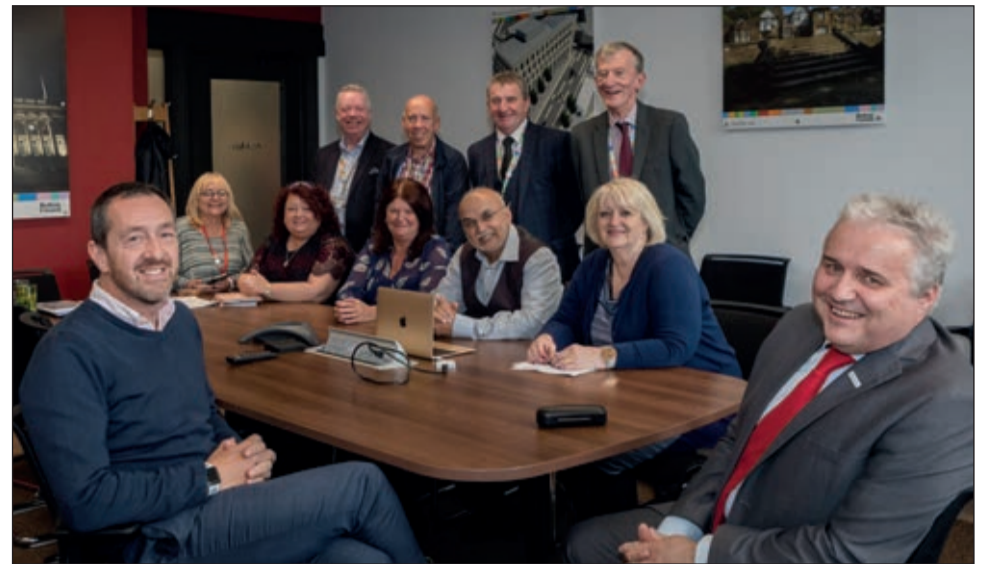
SAFE ROUTES: Champion cyclist Chris Boardman presenting the plans to the council's Cabinet

Greater Manchester's Cycling and Walking Commissioner, Chris Boardman, said: "The list of proposed projects announced is the first of many for each local authority. One thing we won't compromise on is quality; we're working closely with all 10 local authorities."