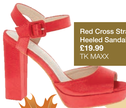
Red Cross Strap Heeled Sandals £19.99 TK MAXX